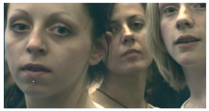
You Made me Love You, 2005, 4 min.