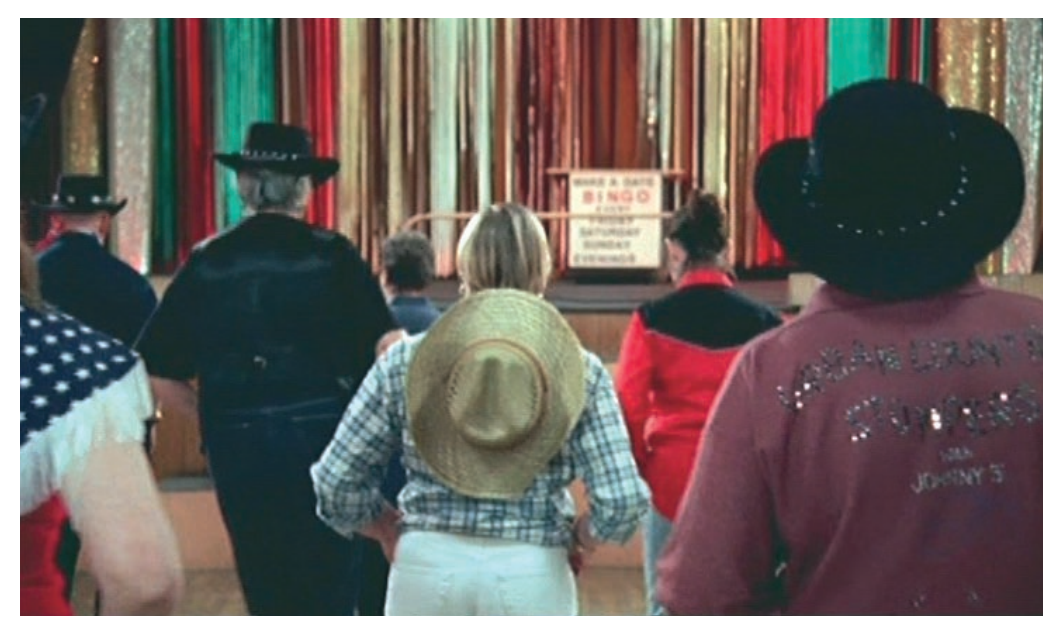
Fisticuffs , 2004, 11 min.